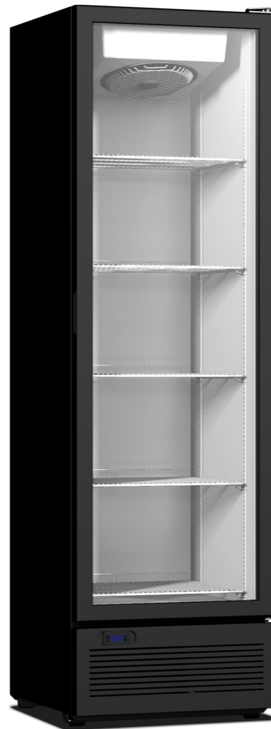
CR 450 595 x 595 x 2018 435lt