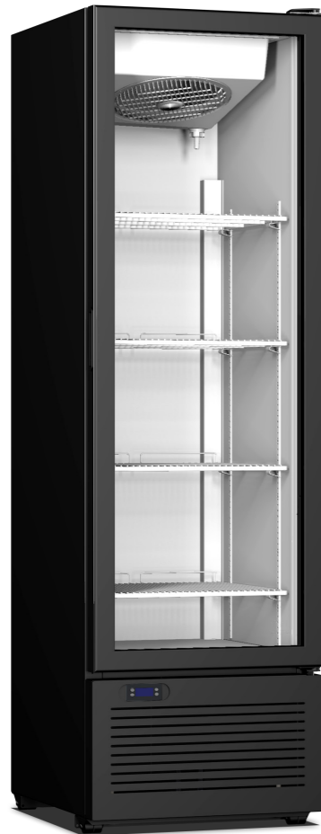
CR 300 530 x 595 x 1793 314lt