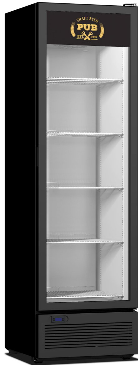
CR 450 SZ 595 x 595 x 2018 435lt