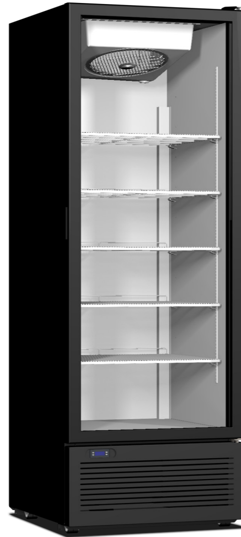
CR 600 667 x 716 x 2018 567lt