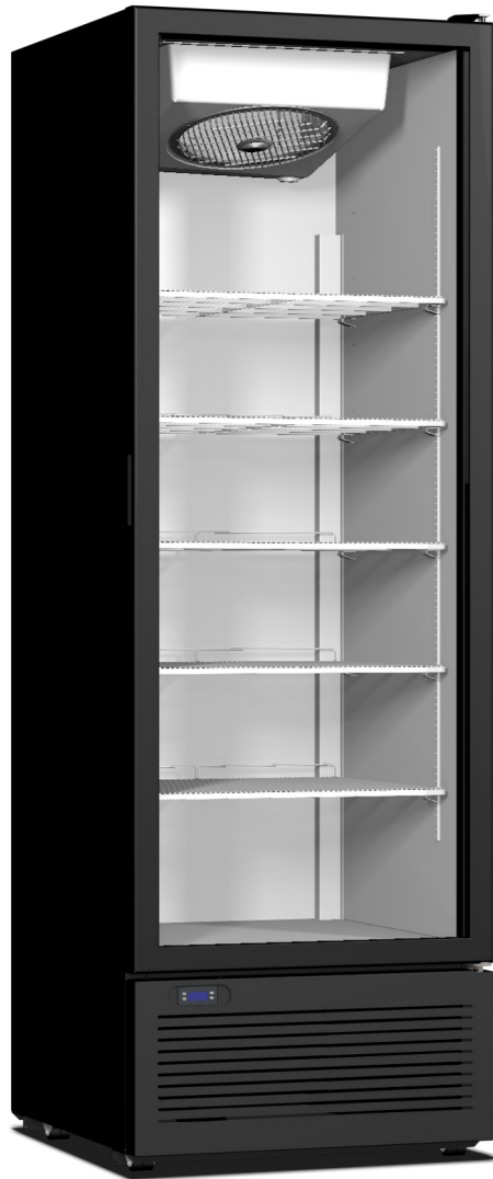
CR 500 667 x 620 x 2018 477lt