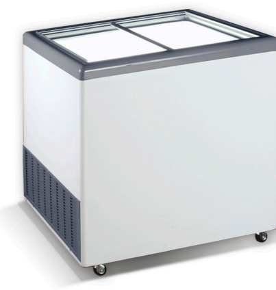
EKTOR 26 SGL 905 x 644 x 895 251lt