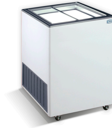
EKTOR 16 SGL 654 x 644 x 899 172lt