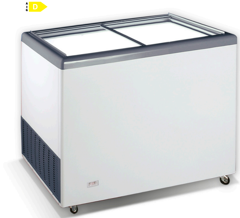
EKTOR 36 SGL 1184 x 644 x 895 356lt