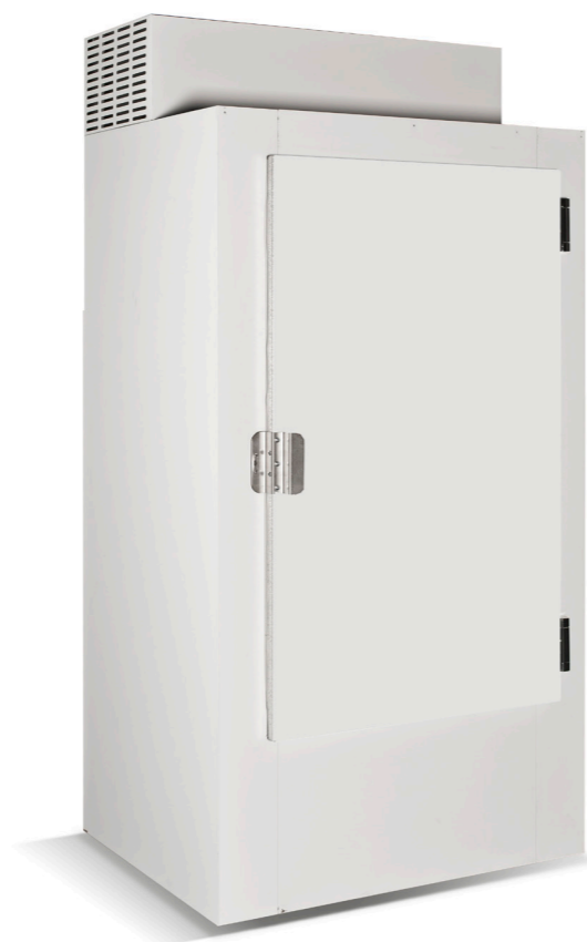
ICEBOX 30 900 x 765 x 1902 703lt