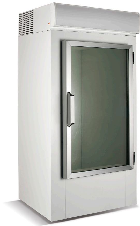
ICEBOX 24 GD 770 x 765 x 1902 590lt