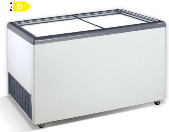
EKTOR 56 SGL 1654 x 644 x 895 535lt