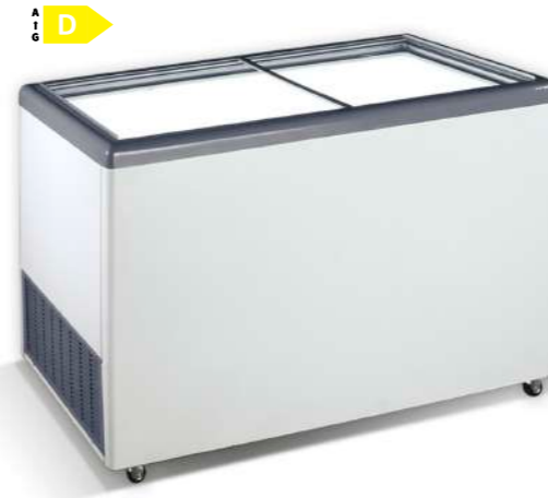
EKTOR 46 SGL 1439 x 644 x 895 445lt

EKTOR 46 SGL • EKTOR 56 SGL • EKTOR 60 SGL