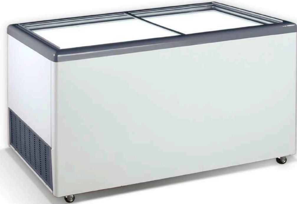
EKTOR 60 SGL 1754 x 644 x 895 575lt